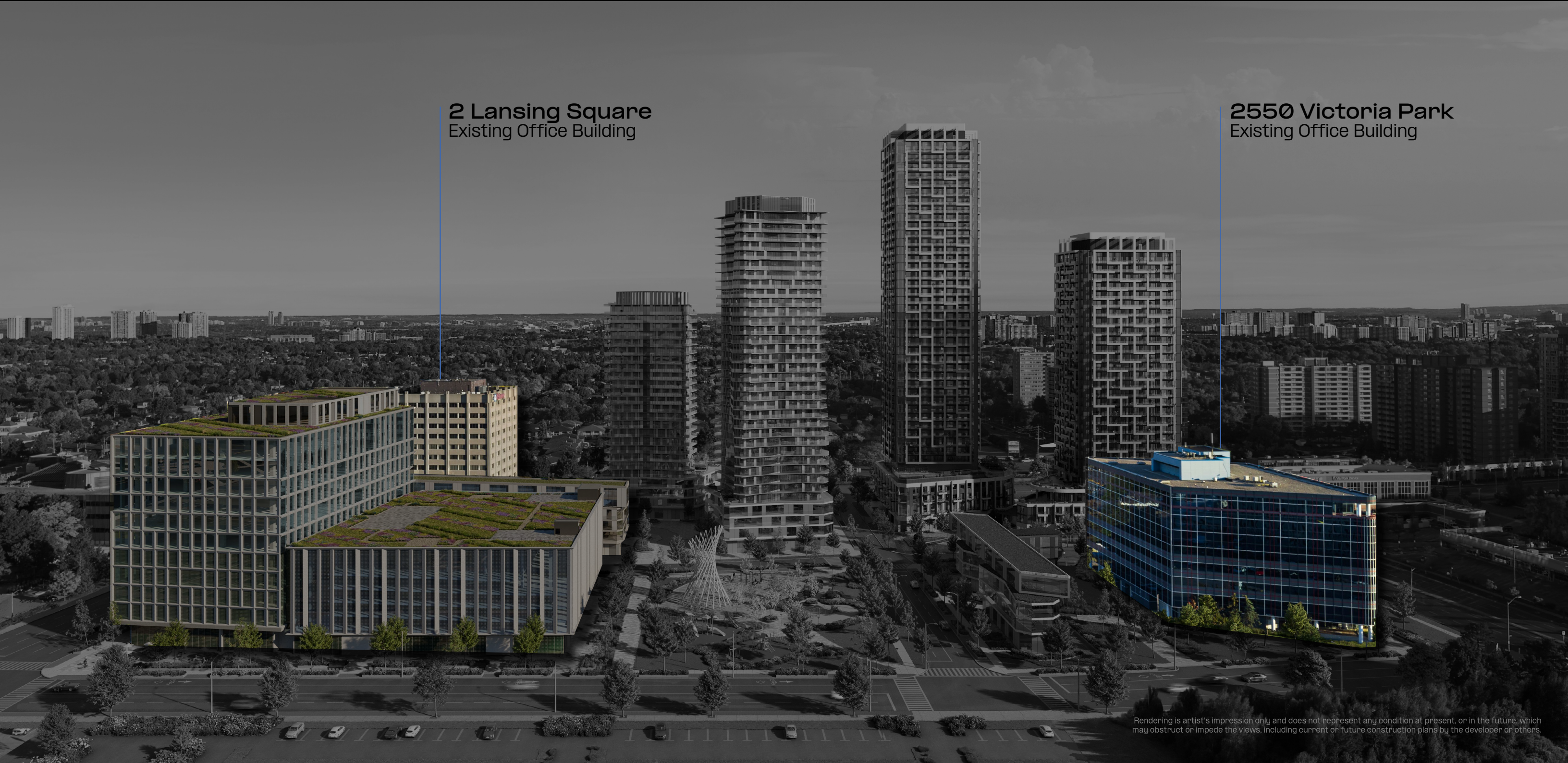
2550 Victoria Park Existing Office Building